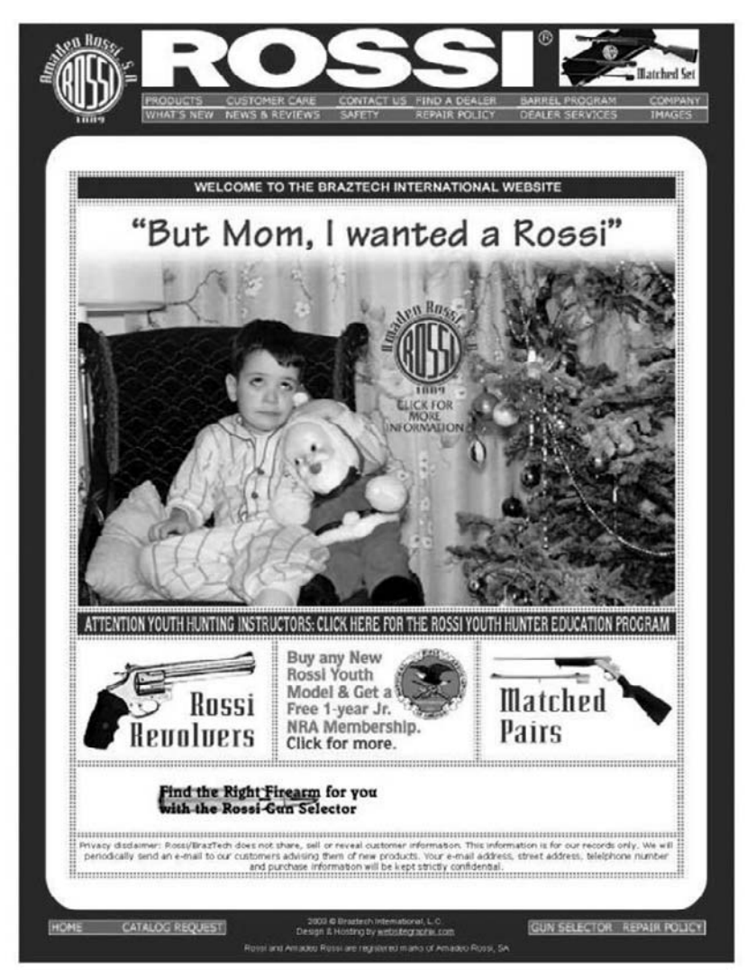
The Web site of gun manufacturer Rossi-USA promotes a one-year junior NRA membership with the purchase of a youth model gun.